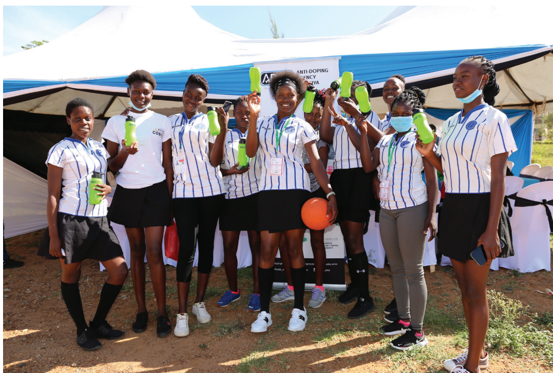
Participants pose with their freebies that they received from the ADAK anti-doping education team after taking part in an anti-doping education quiz during an outreach session at Kibabii University.