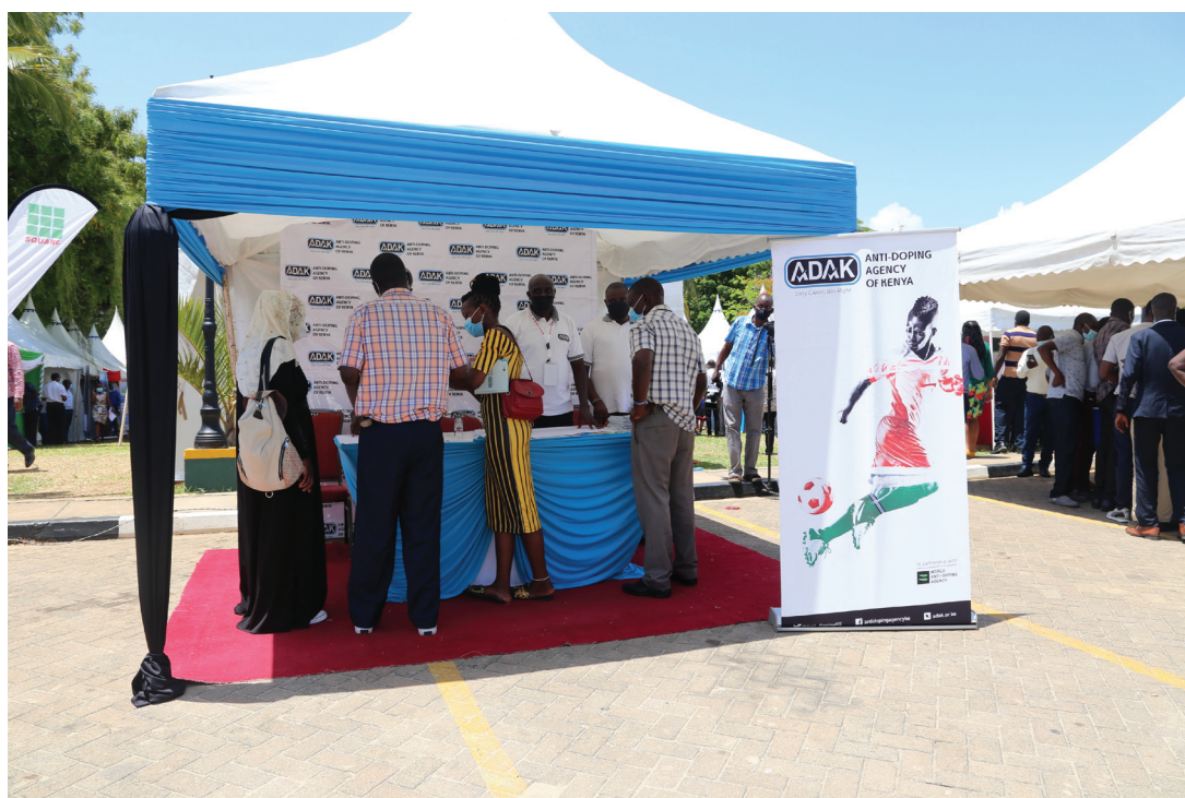
ADAK anti-doping educators pitch tent at the 21st edition of the Kenya Clinical Officers Association (KCOA) annual conference. ADK seeks to have a high number of medical professionals getting involved in the eradication of doping in sport.